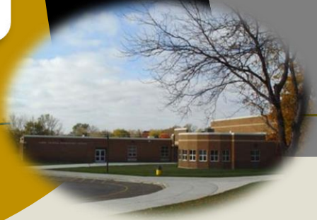
Dirksen Junior High School