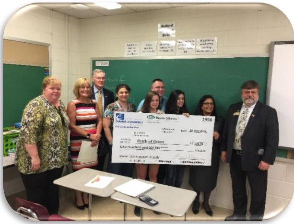
Student winners receive honorary “big check” and Superintendent shows support for their achievement.

The 7 th Annual Joliet Chamber of Commerce Entrepreneurs club Expo was held in April 2018 at the University of St. Francis. The goal of the event is to promote creativity and innovations among the 6 th , 7 th , and 8 th grade students. More than 50 student teams from Gompers, Washington, Hufford, Dirksen, Troy, Rockdale, St. Raymond and Channahon participated in an entrepreneurship convention seeking mock investors.