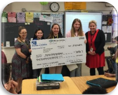
Teacher sponsors and Student winners