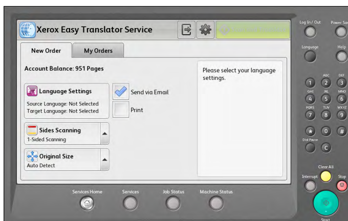
Xerox Easy Translator Service MFP user interface